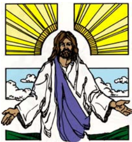
"Why do you look for the living among the dead? He is not here but has risen." Luke 24:5